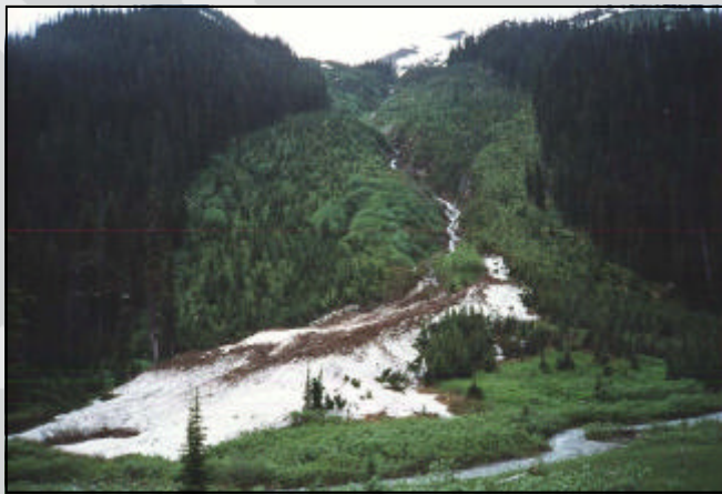
(North Thompson, British Columbia.)

Climate and terrain studies are undertaken to estimate the avalanches risk associated with forest development, especially above highways or occupied areas. Solutions may involve modifications to forest development or harvesting plans.