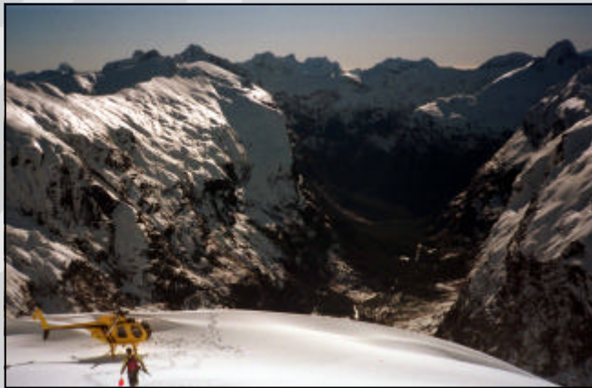
(Snow investigations, Milford Road, NZ).

Snow avalanches occur naturally in many forested areas. Expert advice is offered on the location of roads and bridges to avoid damage or destruction by avalanches.